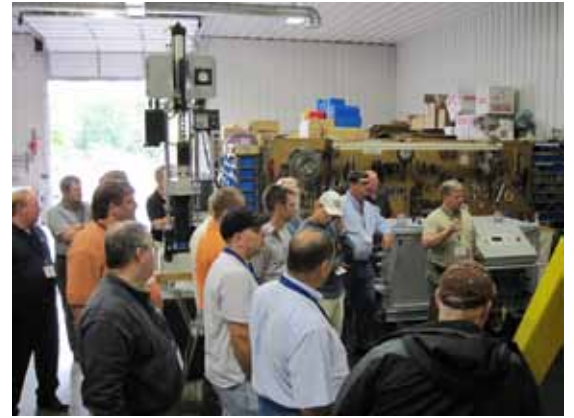
Hands-on equipment demos