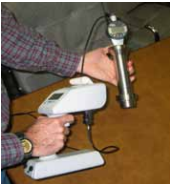
Biach SEMS III