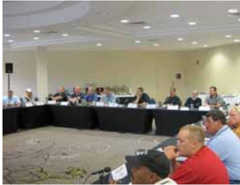
Presentations & Discussions