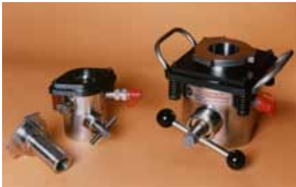
Biach's CC Style Bolt Tensioners

Sealed Air (China) ordered two Biach CC175 Bolt Tensioners powered by our Model 4000 pumping unit.