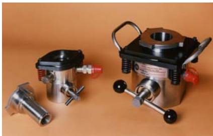
Biach's CC Style Bolt Tensioners

Sealed Air (China) ordered two Biach CC175 Bolt Tensioners powered by our Model 4000 pumping unit.