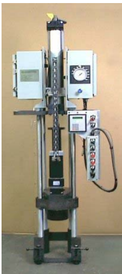
Biach's Electric Stud Drive Tool