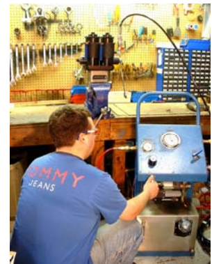
photo depicts testing being performed on refurbished equipment

Invista returned some of their stud tensioners for refurbishment by Biach in preparation of shutdown use.